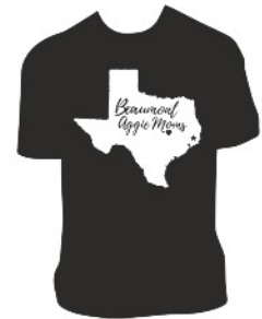
Back of Shirt